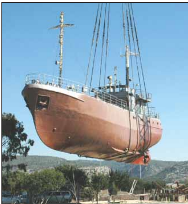
MONUMENT TO ILLEGAL IMMIGRATION — The Atlit Illegal Immigration Camp, a national monument south of Haifa, now has a 230-ton fishing boat to remind visitors of the type of small craft used by European Jews from 1939-48 as they tried to reach Palestine and evade the British blockade. The boat, a 40-year-old vessel purchased from Latvia, was hoisted into place on November 5 (above).