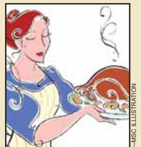
Make Thanksgiving a real family affair by preparing ahead, page 9.